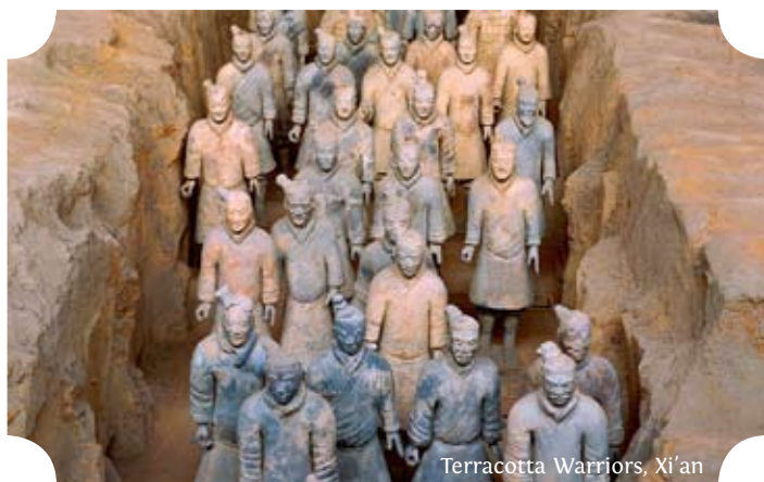
Terracotta Warriors, Xi'an