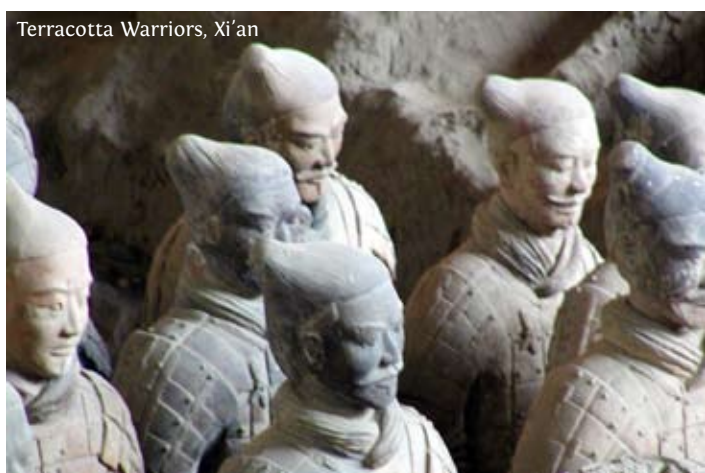
Terracotta Warriors, Xi'an