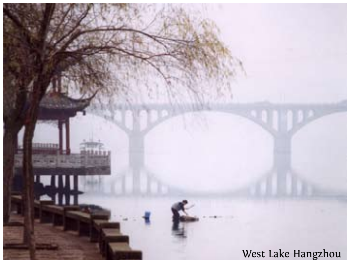
West Lake Hangzhou