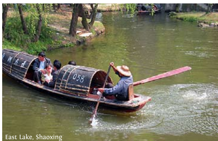
East Lake, Shaoxing