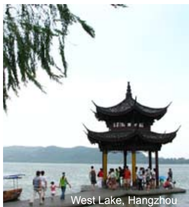
West Lake, Hangzhou