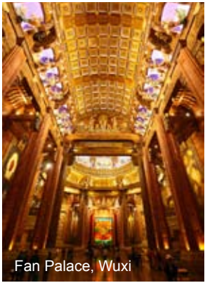
Fan Palace, Wuxi