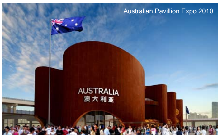
Australian Pavilion Expo 2010